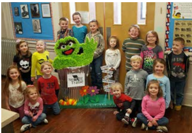
The 2017 Grand Prize winner for the statewide trash can contest was "Oscar will be your fan, if you keep it in the can!" from Cowgill Elementary in Cowgill, Mo.