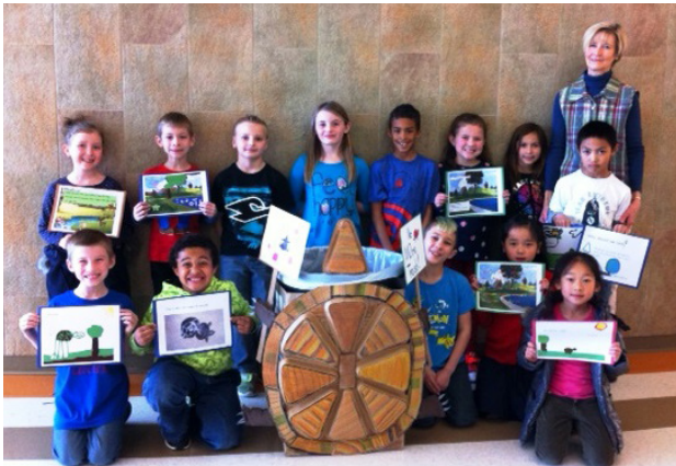
The 2016 Grand Prize winner for the statewide trash can contest was "Box up your recyclables: three-toed box turtle" from East Elementary School in Waynesville, Mo.